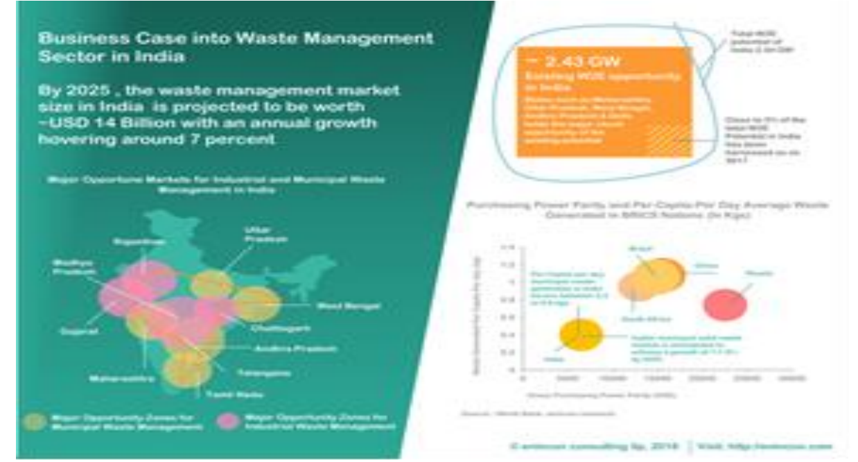
Fig. 2.2 Business Case into Waste Management in India